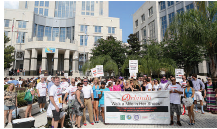
Walk a Mile in Her Shoes Orlando participants gather at the Orange County Courthouse to kick off the walk.

With an issue as far reaching as domestic abuse, it really does take our whole community's involvement to make a difference. With the generous support of individuals like you and our treasured community partners, we can do it! _{\rm HH}